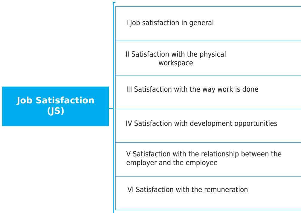
Figure 1. Job satisfaction as a global construct covering specific satisfaction attitudes