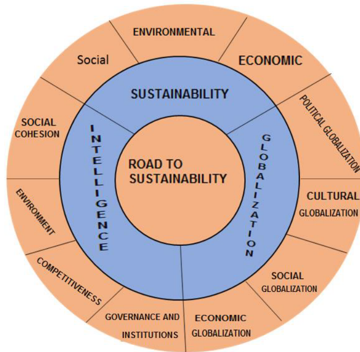
Figure 1. Virtuous Circle of Sustainable Development in Cities